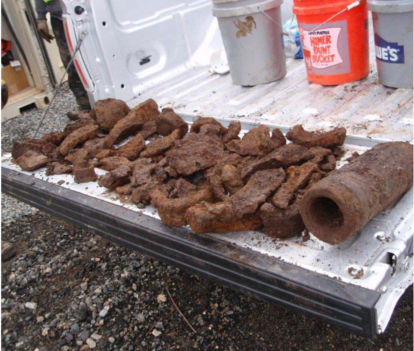
Munition Debris Tilcon Quarry 02282011