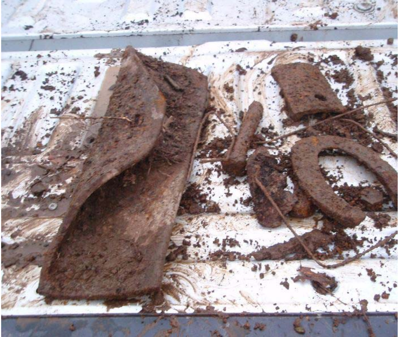
Metal Scrap TILCON QUARRY 02282011