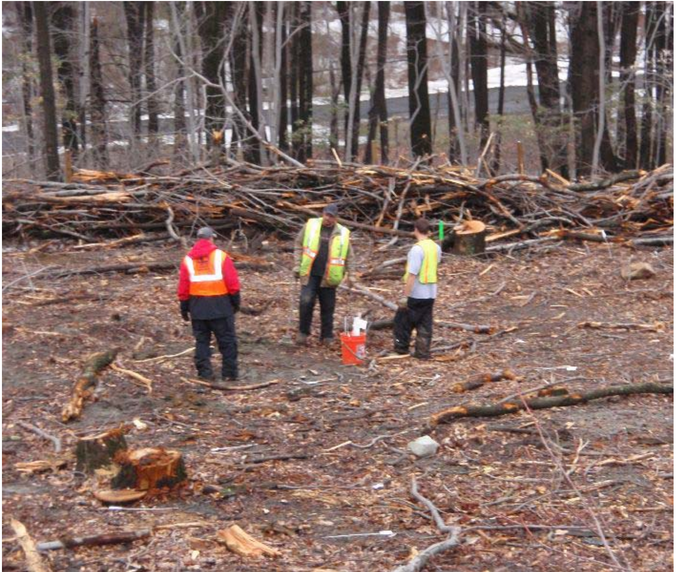
USACE REP Observing dig team 02282011